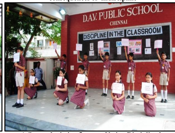
A Scene depicting 5 ways of being Disciplined in the Classroom