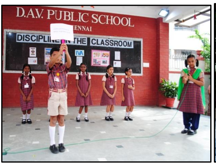
Teacher's Role in disciplined behaviour