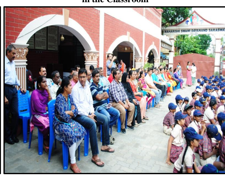
Parents enjoying the morning assembly