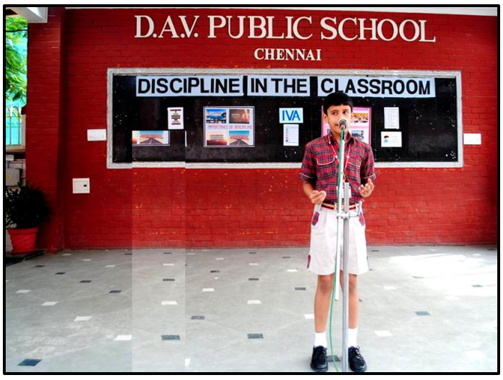
A Speech on Importance of disciplined behaviour

TOPIC: HOW TO BE DISCIPLINED IN THE CLASSROOM - 5 WAYS