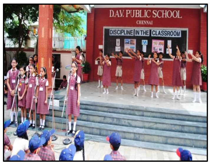
Dance – 'Follow the rules and have fun!'