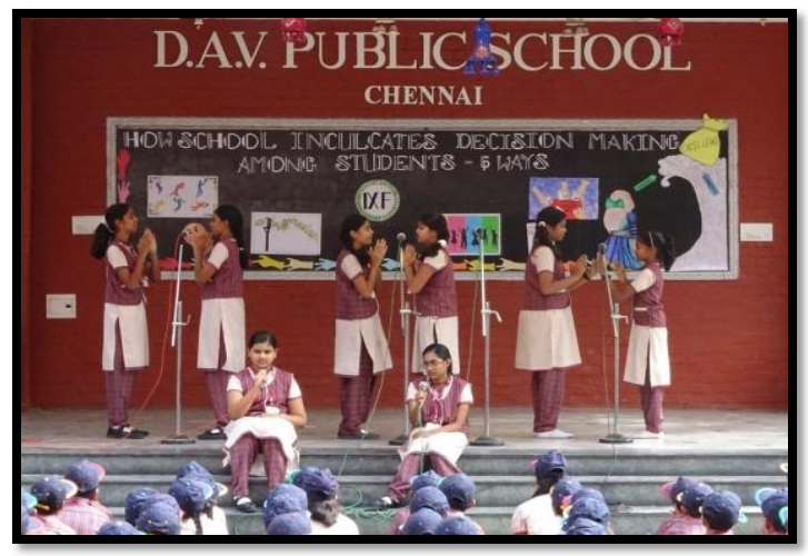
Inter Murals - Innovative Display of Talent