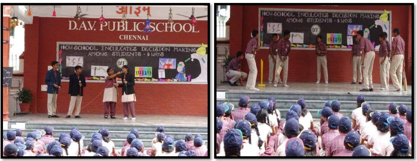
Yoke Bearers – Deciding their Leaders