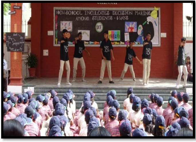
Inter School Cultural Fest – Dancing to the Rhythmic Tune