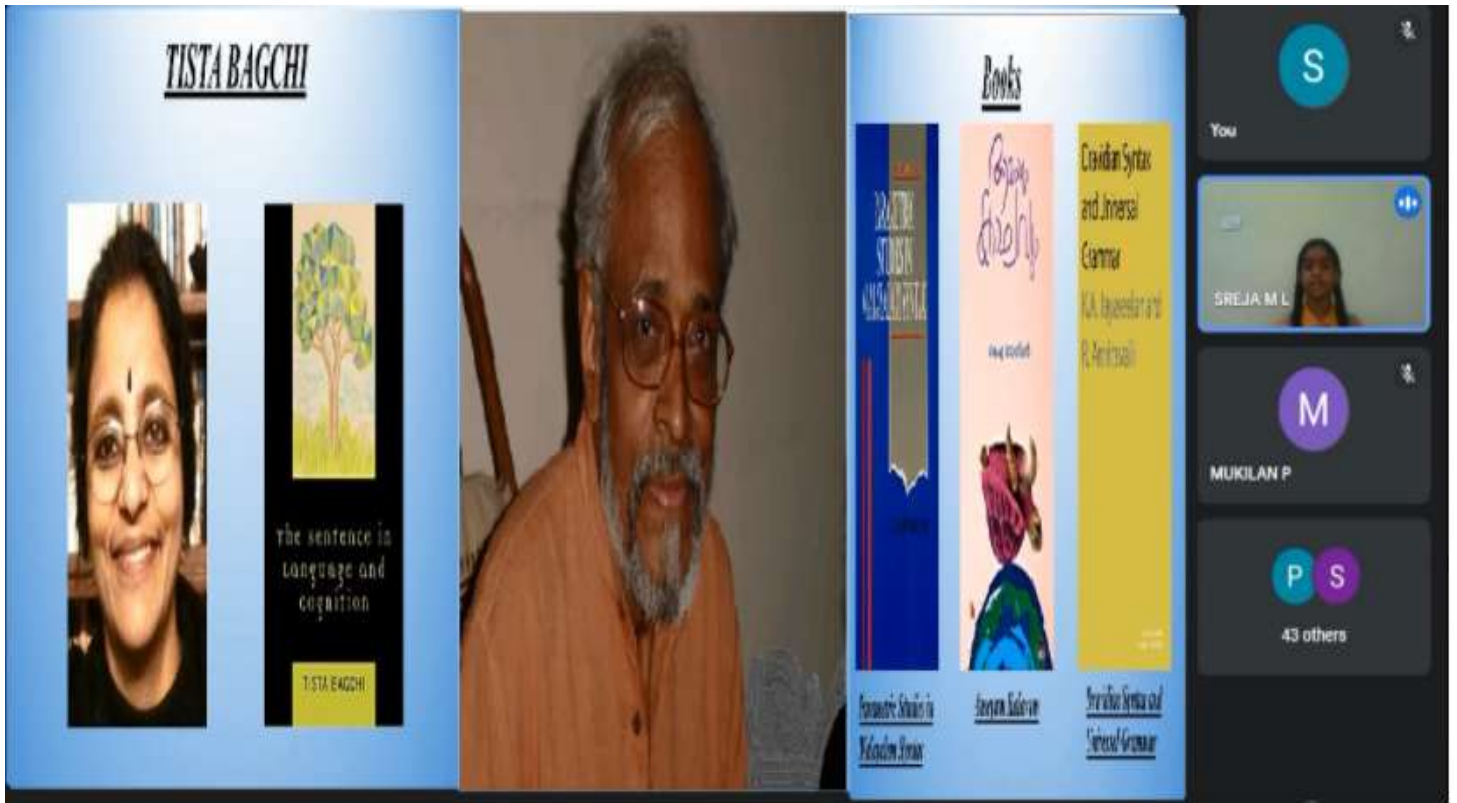
Talk Show- Prominent Personalities with Linguistic Intelligence