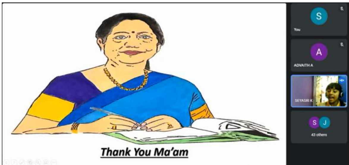
An Anecdotal Presentation through illustrations