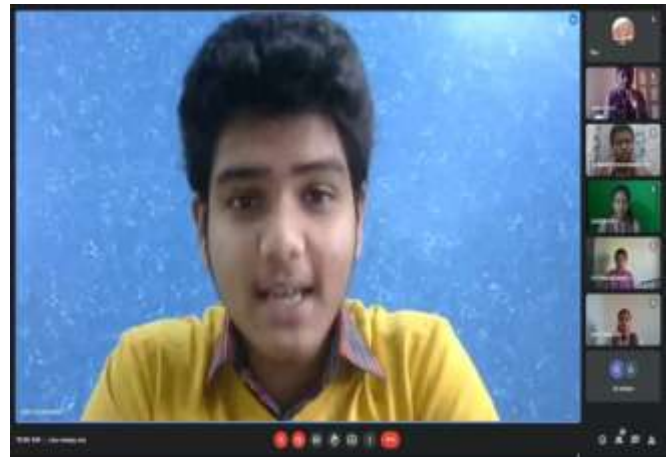
ROLE PLAY - Inculcating Moral Values among the Students