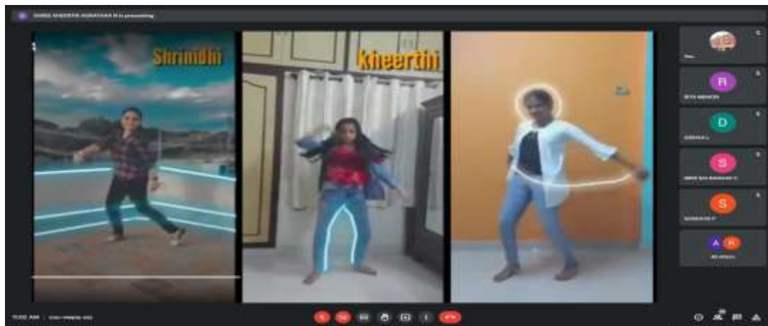
ART IN MOTION – Dance based on Thematic Songs