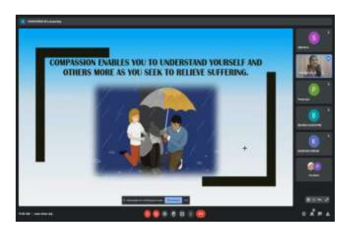
TALE OF BENEVOLENCE - Inspirational Acts of Kindness