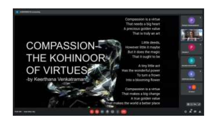
COMPASSION – THE KOHINOOR OF VIRTUES – Poetic Expression