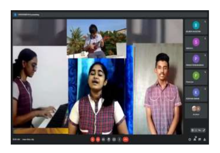
INSAAN: A Tribute To HumanitySoulful Rendition dedicated to the Principal