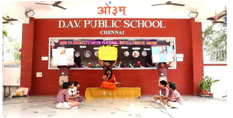
Thirukkural -Thoughts of Knowledge