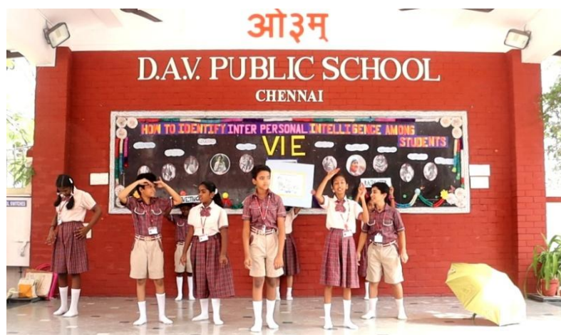
Stage Craft (Water Harvesting)