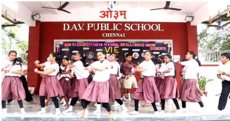
Beats of Intelligence - Enthralling Dance Performance