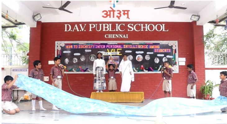
Enlightening Words of Craft Personalities