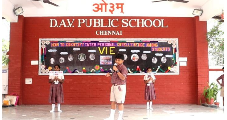
Verbal Expression - Speech on Interpersonal Intelligence