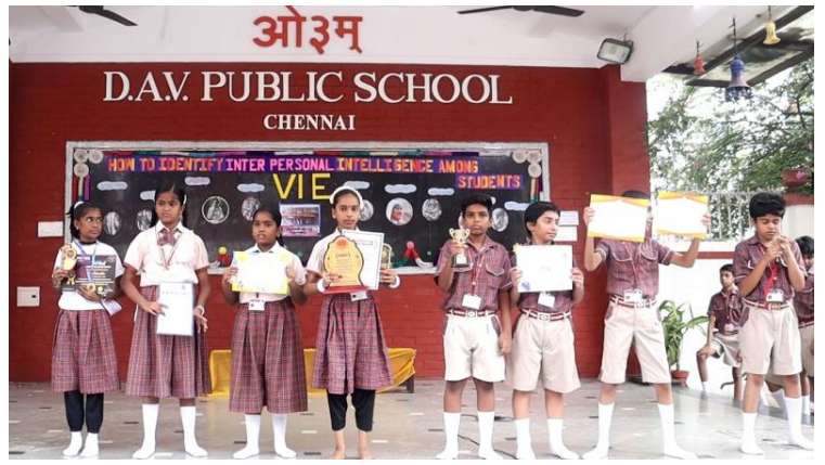
Achievements of Class VI Students