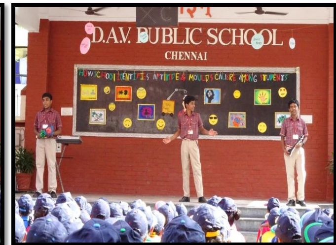
Intra Personal Intelligence – Winners on Stage