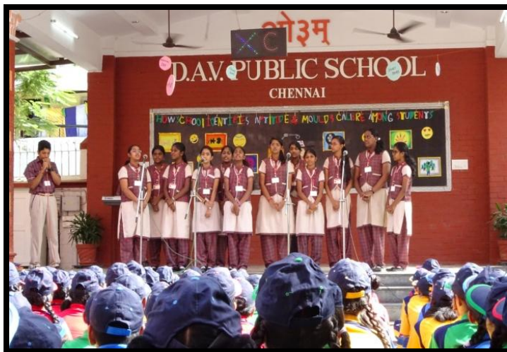
Musical Intelligence – Rhythmic Feast