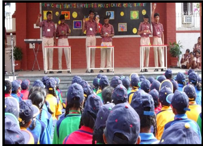
Logical Intelligence – Solving Rubik's cube