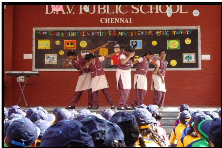
Kinesthetic Intelligence – Flexi Feet