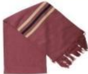
W.B. Boys Muffer