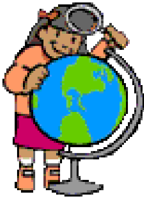
My World and Me