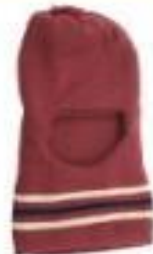
W.B. Monkey Cap