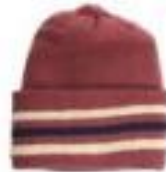
W.B. Half Cap