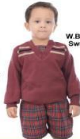
W.B. DAV Sweater