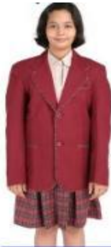
W.B. DAV Blazer