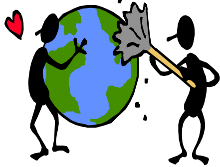
Taking Care of Our World