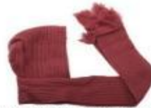
W.B. Girls Cap with Muffer