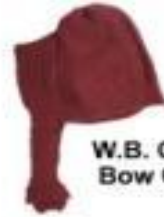
W.B. Girls Bow Cap