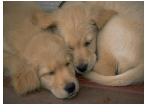
Animals / Animals' Homes