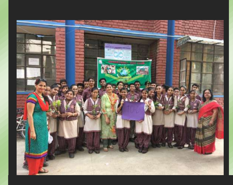
The best thing one can do when it's raining is to let it rain. -Henry Wadsworth Longfellow